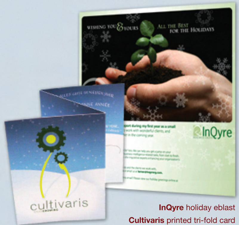
InQyre holiday eblast Cultivaris printed tri-fold card

Beat the holiday rush. Pick your package today!